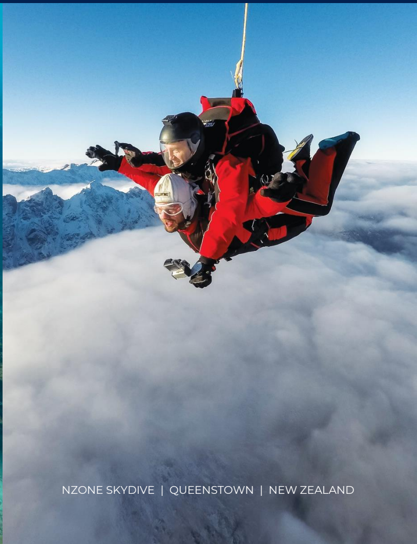
NZONE SKYDIVE | QUEENSTOWN | NEW ZEALAND