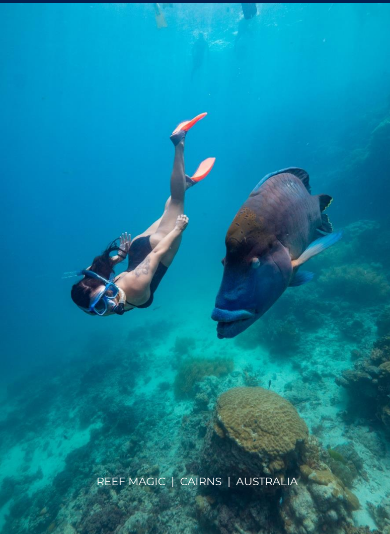
REEF MAGIC | CAIRNS | AUSTRALIA